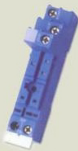
DIN RAIL SOCKET